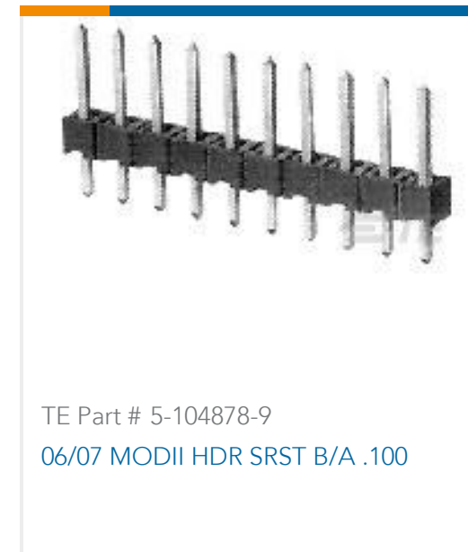
TE Part # 5-104878-9 06/07 MODII HDR SRST B/A .100