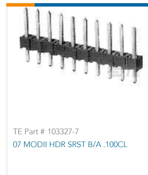
TE Part # 103327-7 07 MODII HDR SRST B/A .100CL