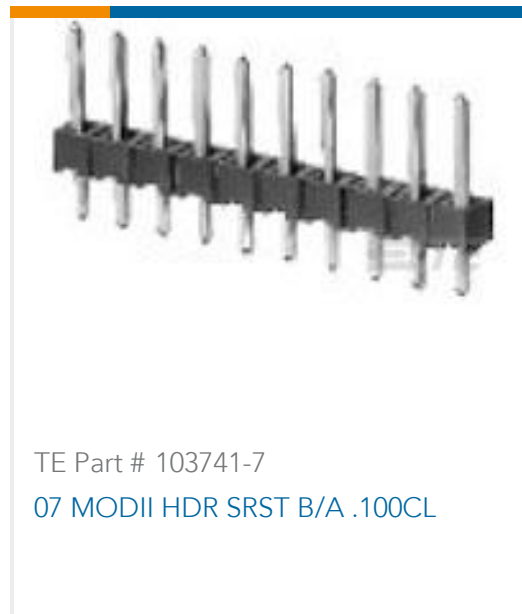
TE Part # 103741-7 07 MODII HDR SRST B/A .100CL