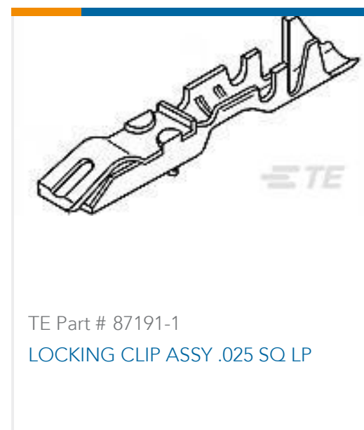
TE Part # 87191-1 LOCKING CLIP ASSY .025 SQ LP