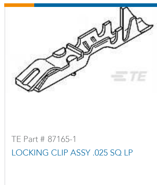
TE Part # 87165-1 LOCKING CLIP ASSY .025 SQ LP