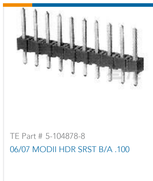
TE Part # 5-104878-8 06/07 MODII HDR SRST B/A .100