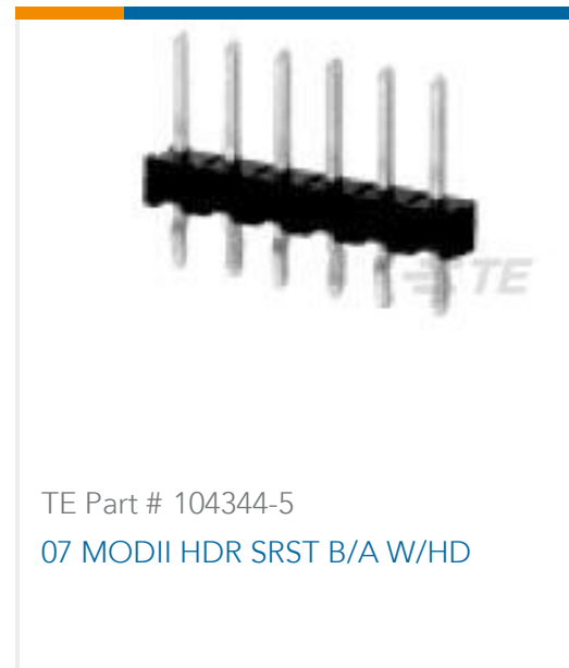
TE Part # 104344-5 07 MODII HDR SRST B/A W/HD