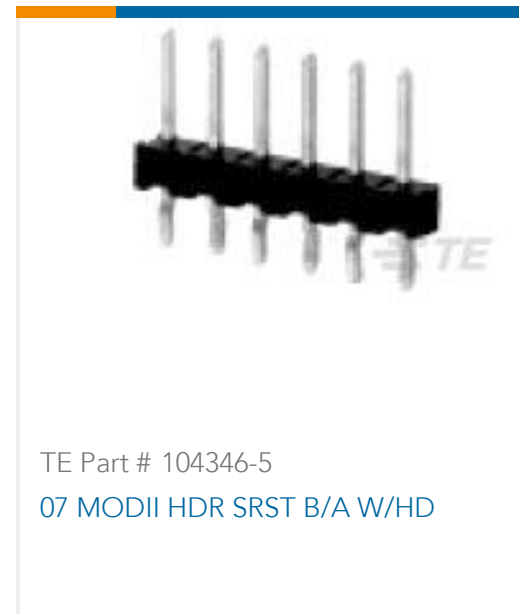
TE Part # 104346-5 07 MODII HDR SRST B/A W/HD